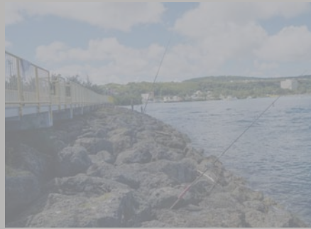
GONE FISHING: Rod and reel fishermen prefer to fish from the rocks near the Hagåtña marina in October 2018, rather than at the fishing platform. The Port Authority of Guam is providing $1 million toward the development of a sea wall to protect the nearby Guam Fishermen's Co-op which will have a new building funded with $3 million in bond funds.

The funds will be given to the Guam Economic Development Authority which will act as the proj-